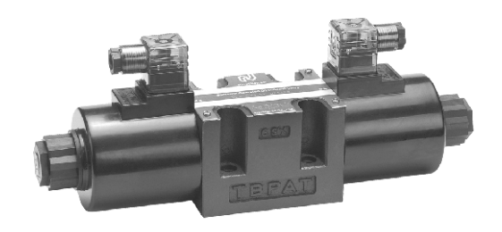
Hirschmann Type With Indicating Lights